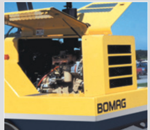
Easy access means fast servicing

With these features and many more, it's easy to see why this model maintains a high residual value while delivering lower lifetime operating costs.