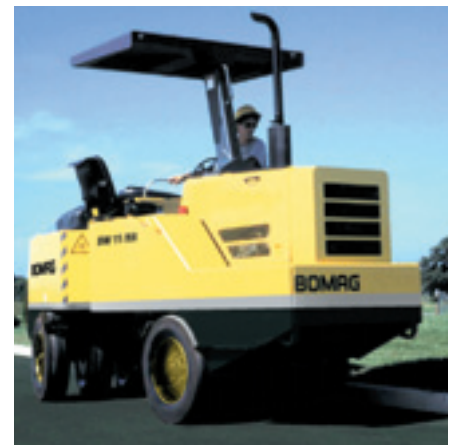
BW11RH in action on an asphalt resurfacing application