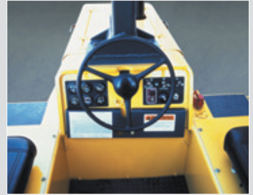
Cockpit design places controls within easy reach and provides unobstructed visibility