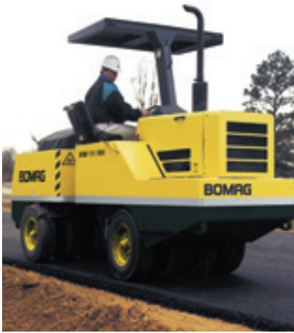
Dual, center facing seats provide excellent visibility in both travel directions