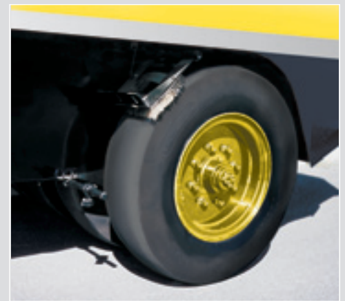
Cocoa mats on each tire help eliminate material pick-up