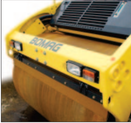
Slanted leg design offers exceptional visibility to both drum work surface, water spray system and surrounding jobsite area.