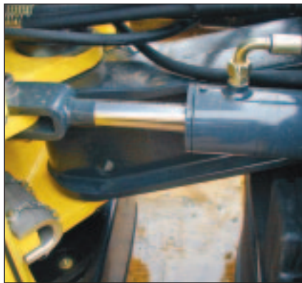
Bolt-in heavy duty oscillating / articulating centerjoint with 6.7 inches offset provision.