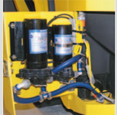
Dual water spray pumps, providing back-up provision.