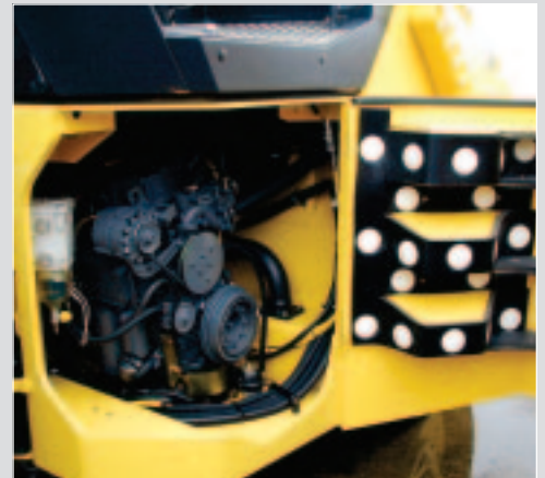
Large swing open doors for easy access to service and maintenance checkpoints.