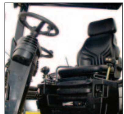
BW 141AD-4 / BW 151AD-4 Operator's platform with sliding/swiveling seating position