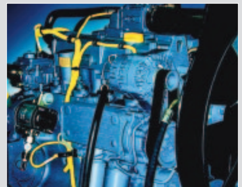
Powerful and fuel efficient Deutz oil-cooled diesel engine.

With these features and many more, it's easy to see why these models maintain a high residual value while delivering lower lifetime operating costs.