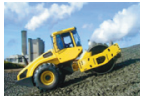
BW213 PDH-4 w/ optional cabin