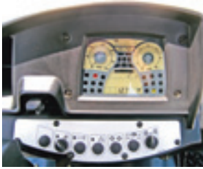
Dash display shown is typical for DH and PDH models