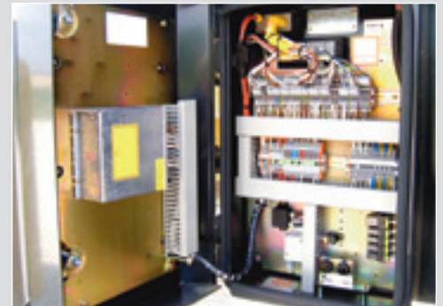
Centralized Electronics for Ease of Servicing and Troubleshooting