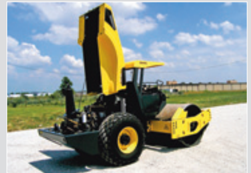
Vertically Opening Hood for Maximum Serviceability