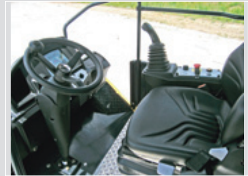
Redesigned Operator's Station for Simplified Operation and Increased Comfort