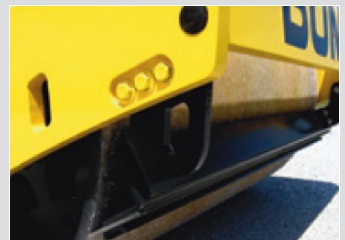
Redesigned Front Frame and Scraper Design for Improved Performance

With these features and many more, it's easy to see why these models maintain a high residual value while delivering lower lifetime operating costs.