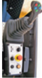
Ergonomic Layout of Controls Provides Precise Operation